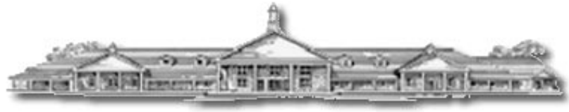
Ayres Tax Seminar Location

1015 Edison Street NW (St. Rt. 619) | Hartville, OH 44632 | 330.877.9353 Hours: Mon - Sat 11am to 8pm | Closed Wed & Sun Great homestyle cooking in a delightful atmosphere since 1966